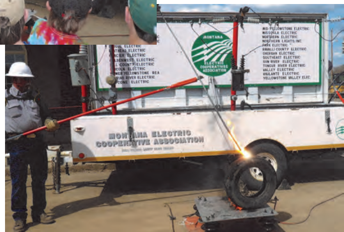
➔ - Circle middle school students attended the co-op's electric safety demonstration